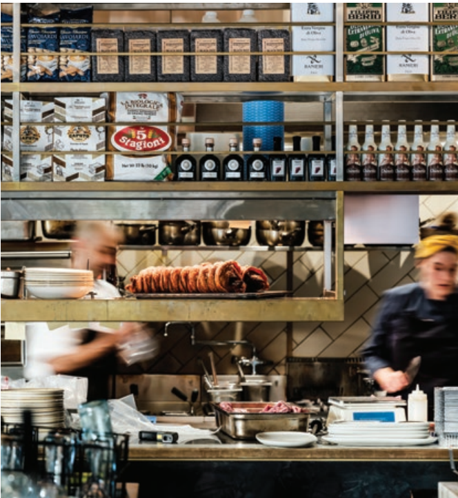
Coffee and conversation ease you into the day; leisurely breakfasts spill over into lunch; then, come evening, Newmarket’s village dining invites alfresco share plates and celebrations.

Newmarket is the bustling new heart of Randwick. This charming village precinct brings inner-city dining and cafe culture to your doorstep, while still only moments away from the city and the beaches.