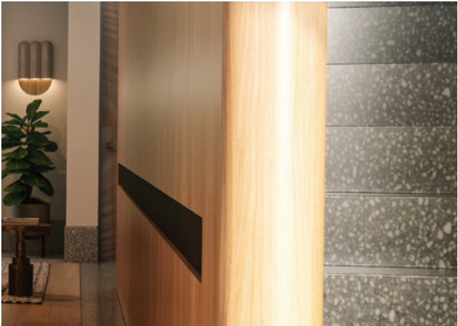
Earthy terrazzo forms the edgings, skirtings and stairs, beautifully complemented by shaped timber veneers.