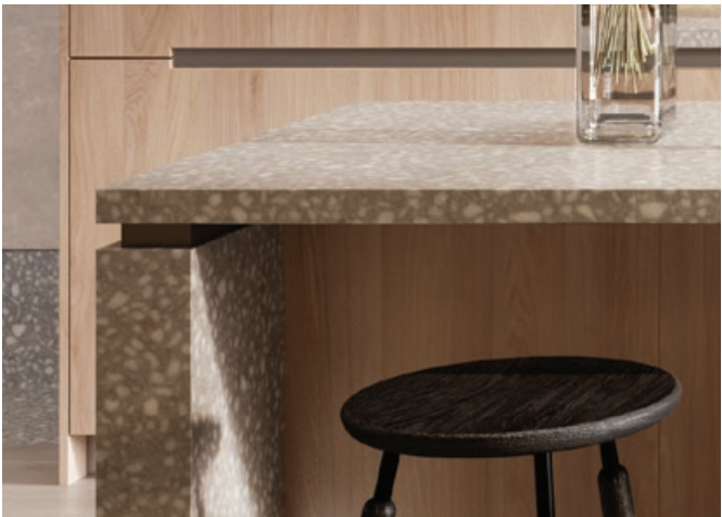
Terrazzo brings understated layers of texture and interest to the kitchen benches, islands and splashbacks.