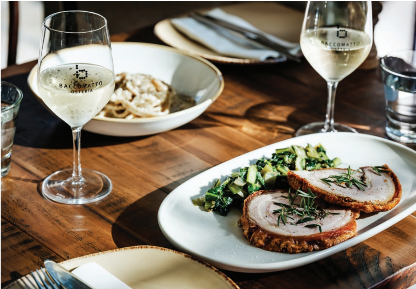
Newmarket Dining’s roll-call of venues includes Sella Vinoteca, Gelato Messina and Baccomatto Osteria, to name a few.